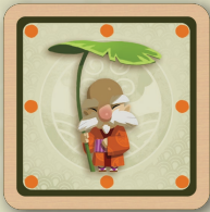
The koropokkuru (leprechaun) is the master of yōkai . 1 sticker

Each player has four types of yōkai – forest spirits. They all have a face with orange dots and one can be turned over to a face with blue dots ( kodama ):