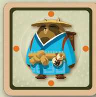
The tanuki (related to the racoon). 1 sticker