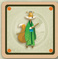
The kitsune (fox). 1 sticker