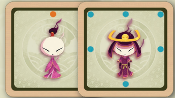
The kodama (tree spirit) can be turned into a kodama samurai . 2 stickers - one for each side

The starting positions of the yōkai are shown here. They all start with the side showing orange dots facing up. A guide is also drawn at the bottom of the board.